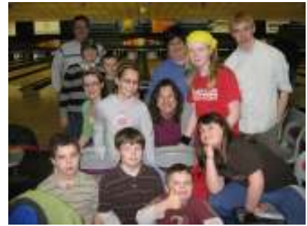
First Presbyterian of Baldwinsville

While snowy weather and an earlier than usual starting hour resulted in lower attendance than in past years, about 60 youth and adult bowlers participated. They represented seven church groups: First Presbyterian United, Camillus Baptist, Bellevue Heights United Methodist, Manlius United Methodist, Fayetteville United Methodist, Baldwinsville First Presbyterian and Onondaga Hill Presbyterian. Two teams from The Reformed Church were snowed-out, but planned to bowl for Habitat independently. In addition, several bowlers represented the law firm of Menter, Rudin & Trivelpiece. Support also came from Teamsters Local #317.